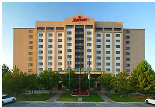
Hotel Group Code: District 10 United States Power Squadrons